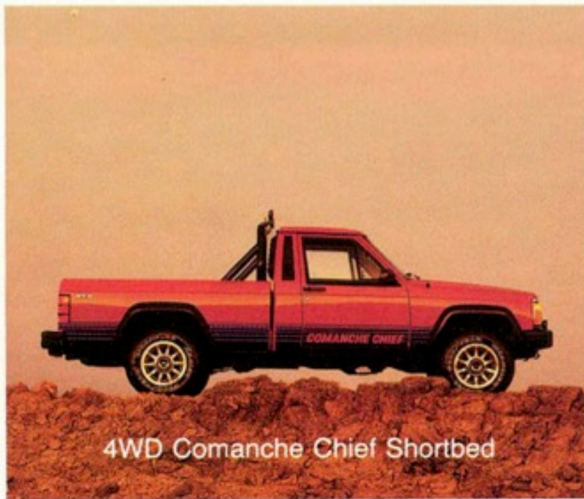
4WD Comanche Chief Shortbed