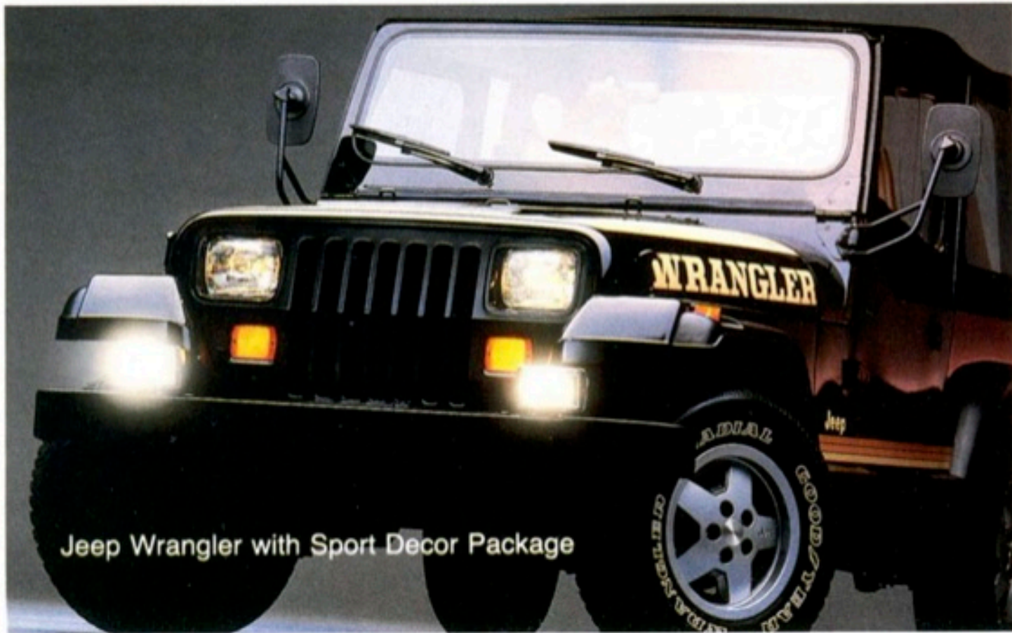
Jeep Wrangler with Sport Decor Package

suspension, 15"x7" wheels, full instrumentation, standard soft top with hard half-doors (or available hard top), and seating for four adults. Wrangler is also available in Laredo, or with Sport Decor Package.