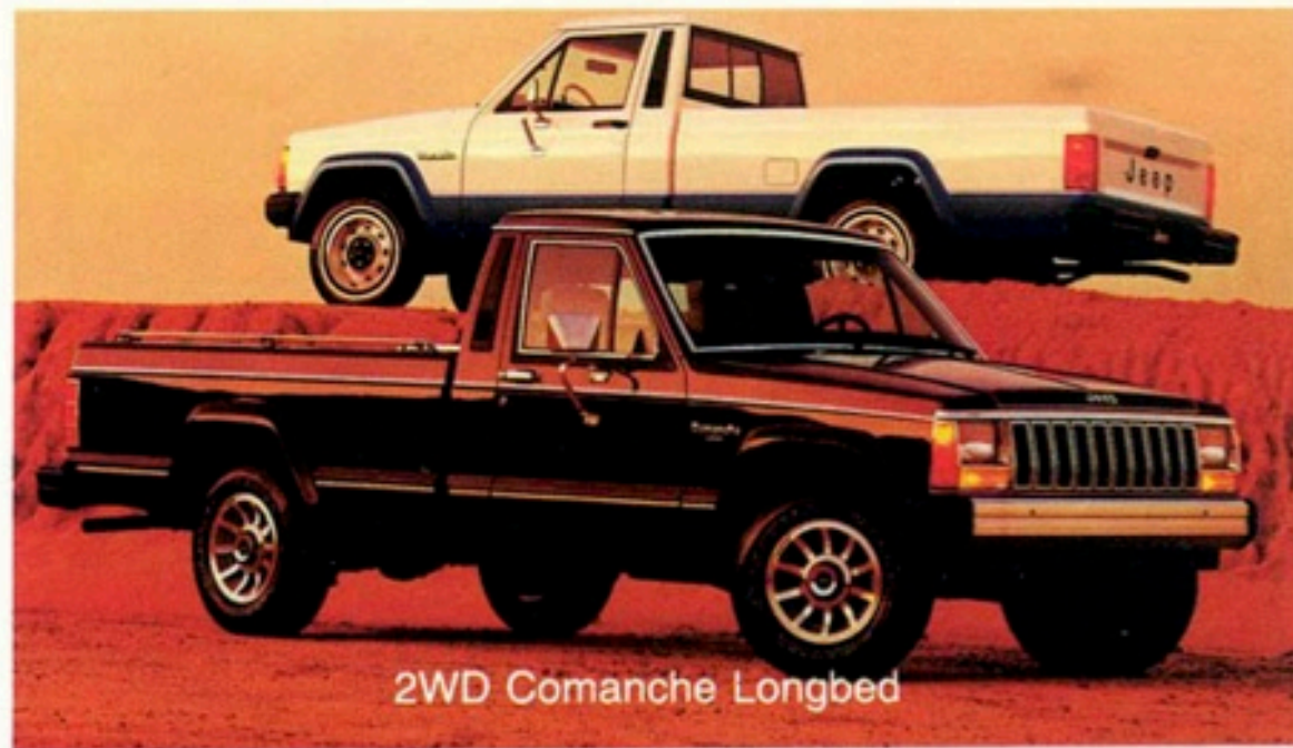
2WD Comanche Longbed

Last year's "Four Wheeler of the Year" (named by Four Wheeler magazine) adds a new chapter to its legend with an available 6-foot short bed. Comanche pickup available in 2-wheel drive or 4-wheel drive, longbed or shortbed, and four Comanche models: Base, Pioneer, Chief, and Laredo. Plus, the specially equipped 2WD or 4WD SporTruck. It's worth a look.