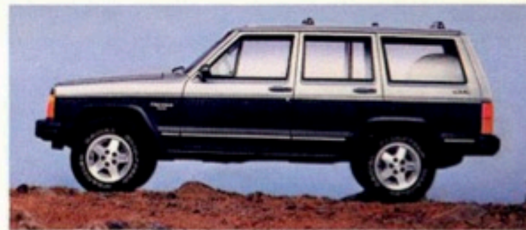
4WD Cherokee Pioneer four-door with two- tone paint treatment