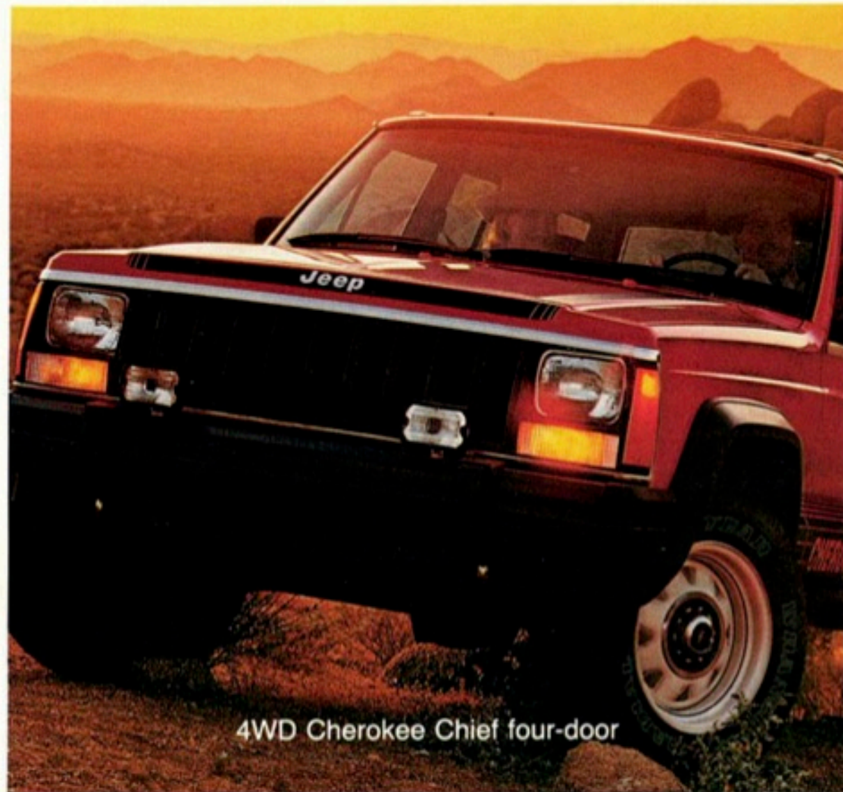
4WD Cherokee Chief four-door