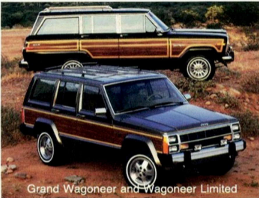
Grand Wagoneer and Wagoneer Limited